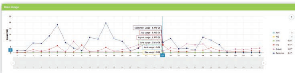
Monitor data usage